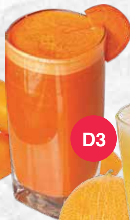
D3 红萝卜汁 Carrot Juice RM10.00