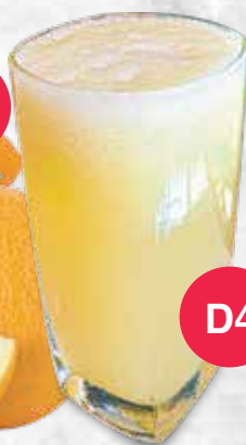
D4 蜜瓜汁 Honey Dew Juice RM10.00