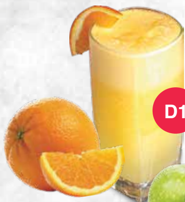
D1 橙汁 Orange Juice RM10.00