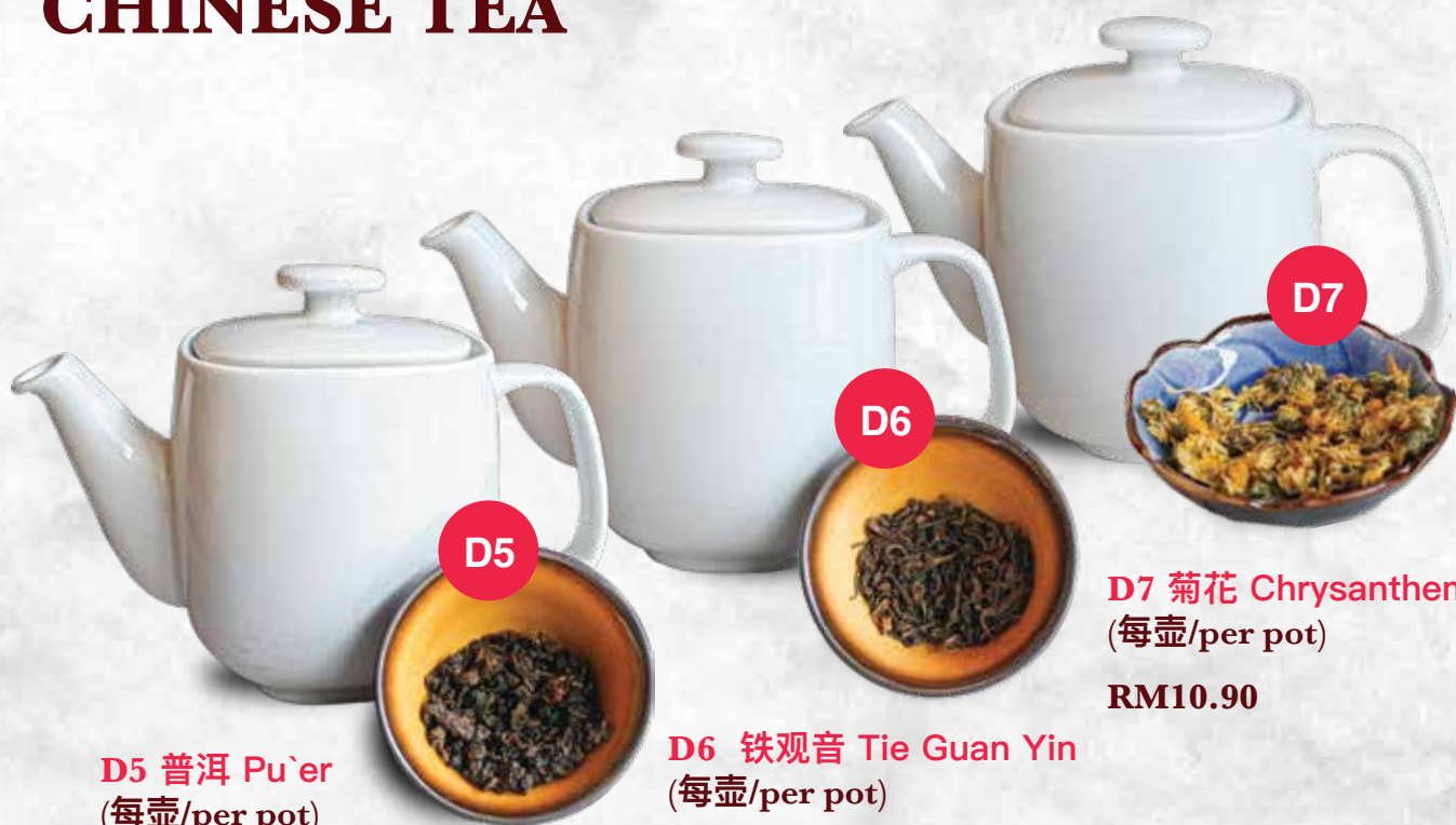
D5 普洱 Pu`er (每壶/per pot)