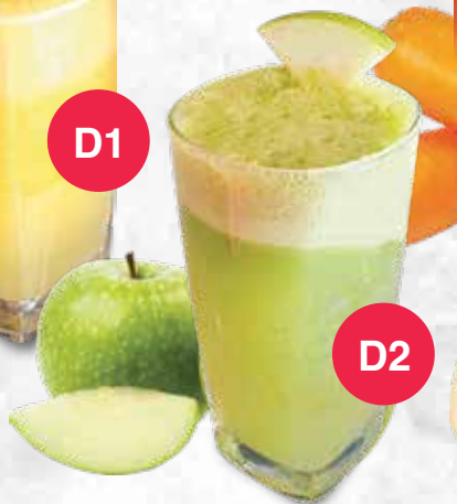
D2 苹果汁 Apple Juice RM10.00